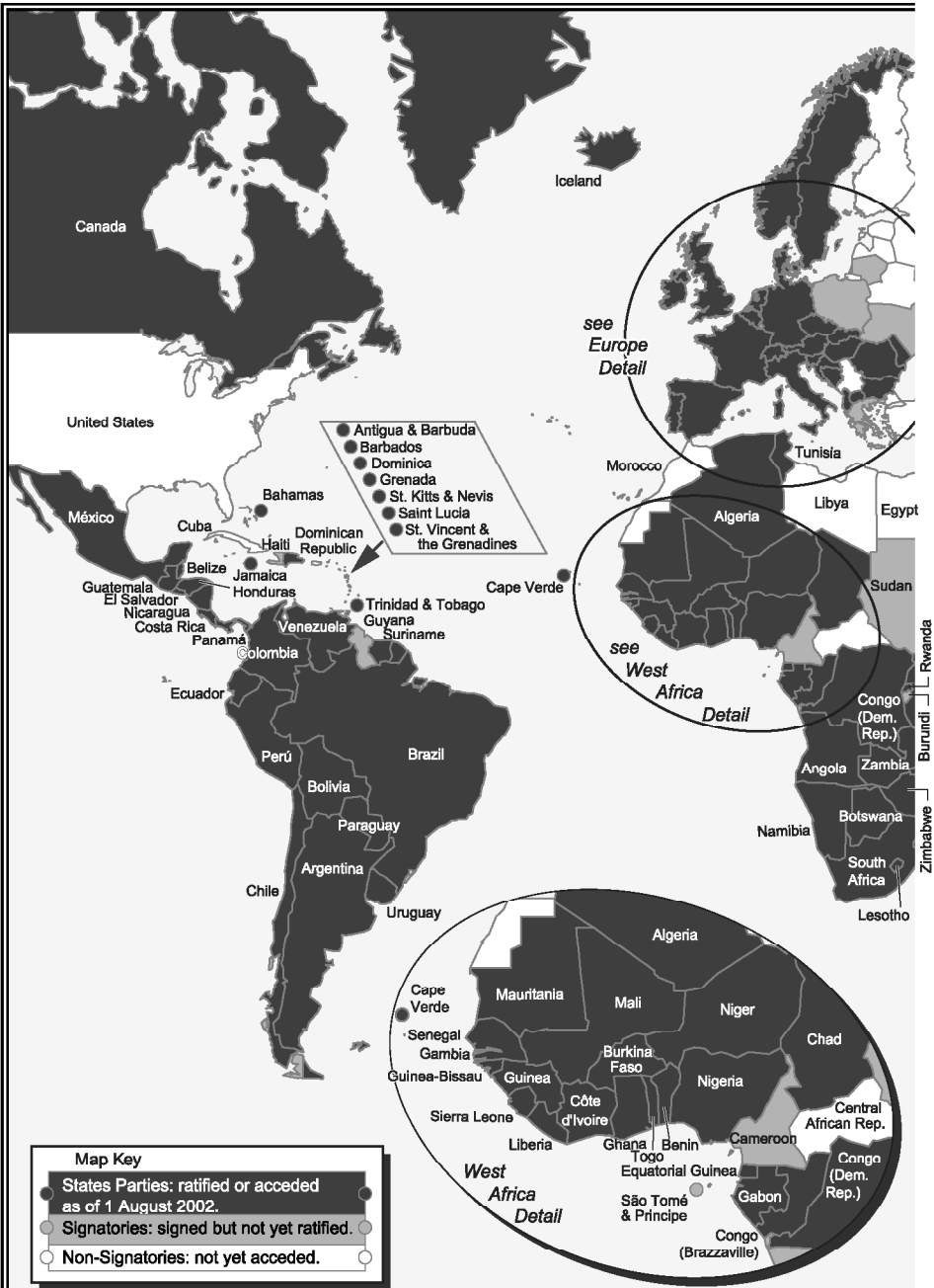
1997 Convention on the Prohibition of the Use, Stockpiling, Production